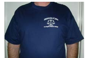
Administration of Justice program T-shirt